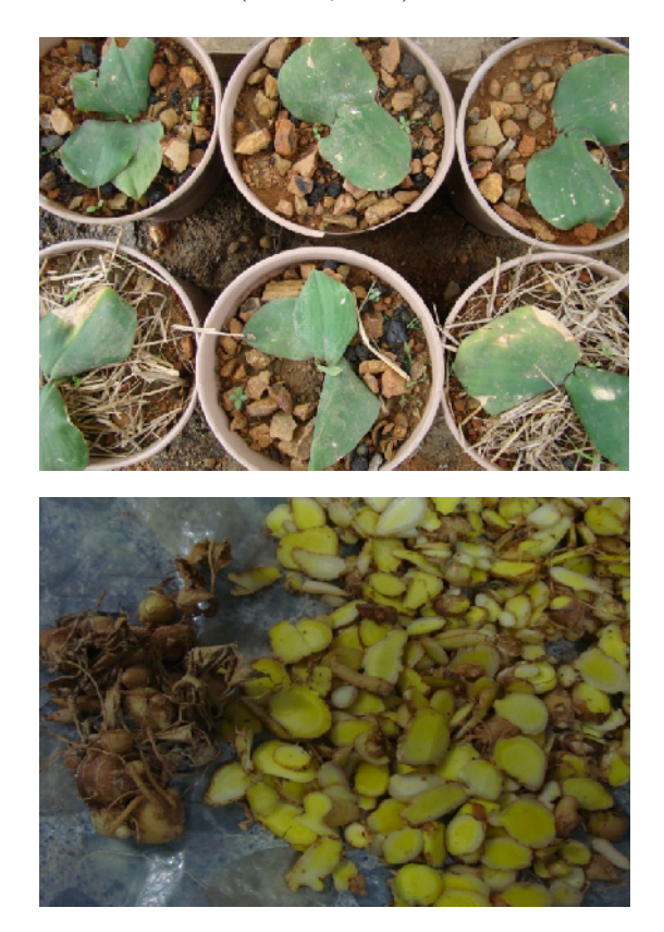
Figure 1. Kaemferia galanga plant and sliced rhizome

Zingiberaceae is among the plant families that are widely distributed throughout the tropics, particularly in South East Asia. It is an important natural resource that provides man with many useful products for food, spices, medicines, dyes, perfume and aesthetics (Burkill, 1996).