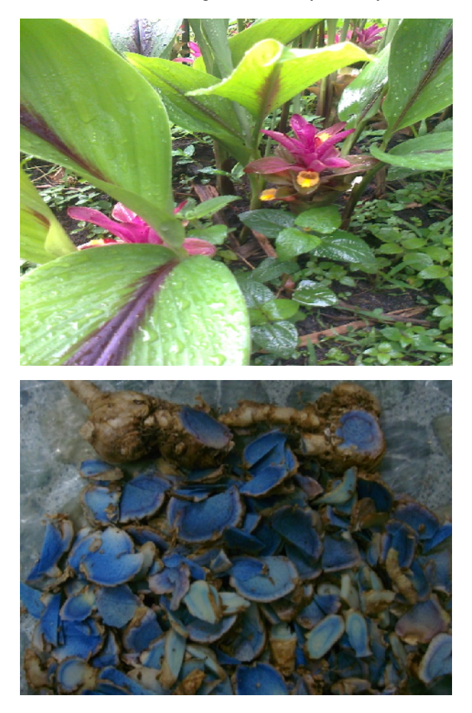
Figure 2. Curcuma caesia plant with their fluorescenct and sliced rhizome

headache, expectorant, diuretic, carminative (Jagadish et al., 2010), stomachic, coughs, pectoral affections, stoppage of nasal blocs, asthma and hypertension (Rahman et al., 2004). It has reported to have expectorant, carminative, diurectic, coughs, pectorial infectious and inflammatory tumors (Fatima et al., 2000), antioxidants (Sataporn et al., 2008) and antimicrobial (Parvezet al., 2005). The methanolic extract of the rhizome contains ethyl p-methoxy trans-cinnamate which is highly cytotoxic to HELA cells (Vincet et al., 1992). The rhizome extract has been potentially active against bacterial infections (Supinya et al., 2005). In Thailand, the rhizome has been used as cardiotonic and CNS stimulant (Mokkhasmit et al., 1971). The rhizome of K.galanga has been used for treatment of fungal derived skin diseases as well as eczema (Tungstronjit, 1978). Which contains essential oils has been used in Chinese medicine as a decoction or powder for treating indigestion, cold, pectoral and abdominal pains, headache and toothache. Due to its increasing demand and overexploitation without ensuring its regeneration, the plant has recently been categorized as an endangered species, the plant is also having some amount of antifungal protein against drug-resistant Candida albicans (Mannangatti and Narayanasamy, 2008).