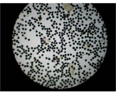
Fig. 1: IR 58025A x IR 84891-B-112-CRA-15-1 (Restorer)

Note: AFG-Average Filled Grains/panicle, AUG-Average Unfilled Grains/panicle, ATGN- Average Total Grain Number/panicle, ASF-Average Spikelet Fertility, APF-Average Pollen Fertility, R-Restorer, PR- Partial Restorer, PM-Partial Maintainer, M-Maintainer, *IRRI: International Rice Research Institute, Philippines; UAS B: University of Agricultural Sciences, Bengaluru, India; ANGRAU: Acharya N G Ranga Agricultural University, India.