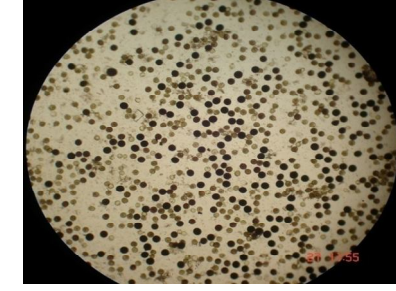
Fig. 2: IR 58025A x IR79975-B-83-4-3 (Partial Restorer)